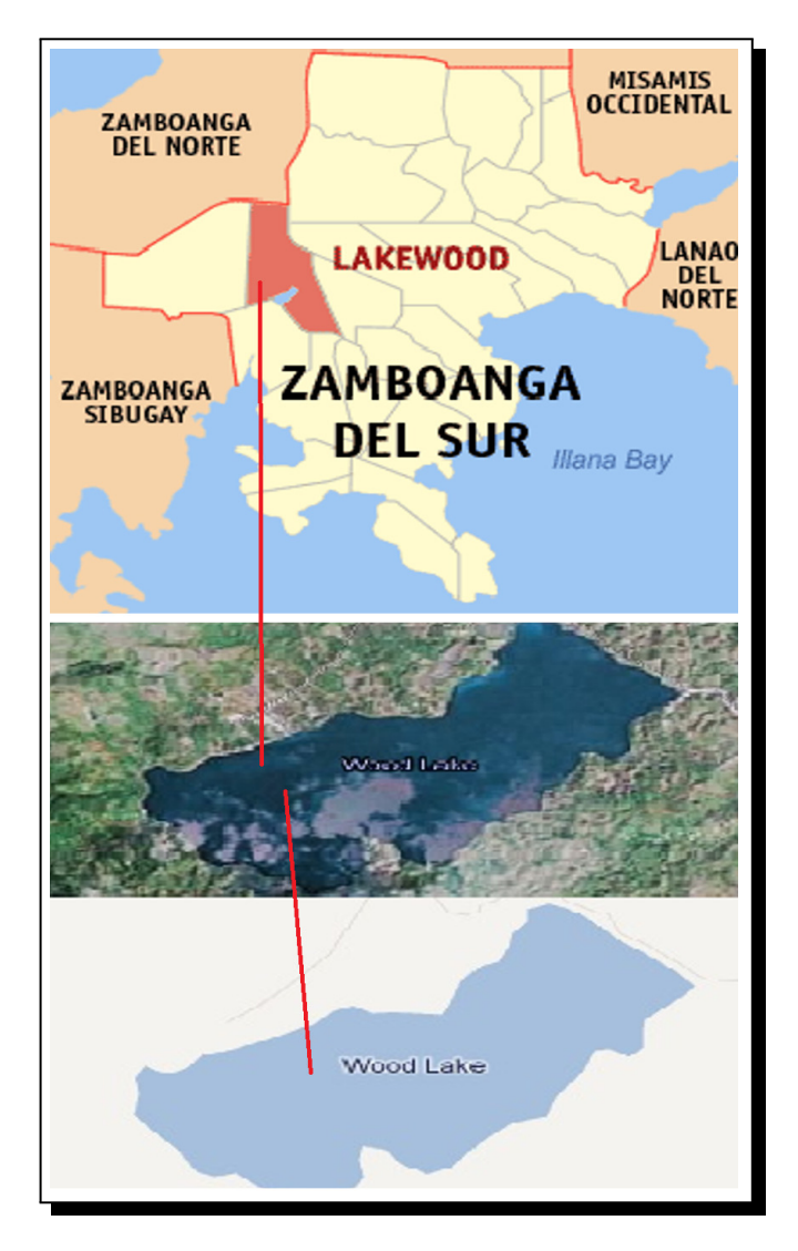
Figure 1. Photograph of the Wood lake in Lakewood, Zamboanga del Sur.

Fish morphometrics is extensively used in fishery science to study phylogeny, phenotypic plasticity, fish condition, differences among stocks or morphotypes and to determine parental species of purported hybrids [10]. Since patterns of population variations play an important role in evolutionary diversification of organisms, many insights into evolutionary processes have come from studies of within population variation over a broad geographical range of species [2]. The porang fish, Rasbora sp. , an endemic species found in Wood Lake of Lakewood, Zamboanga del Sur, which is located in the eastern part of the central Zamboanga Peninsula, is 7 degrees, 49'60'' north and 123 degrees, 9'0'' south (Figure 1).